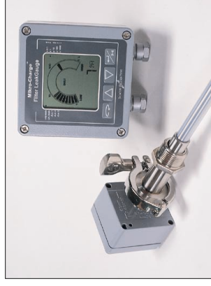
Mikro-Charge leak detector

Whether you need spare parts, equipment service, or complete system rebuilds, we are here to help you.