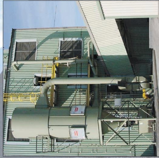
Filtration of crusher dust.

Because the motors are external to the housing, the RAF-IS' temperature handling capability is limited only by the media. For example, the RAF-IS can filter 350°F air when using aramid bags.