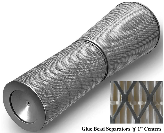
Glue Bead Separators @ 1” Centers